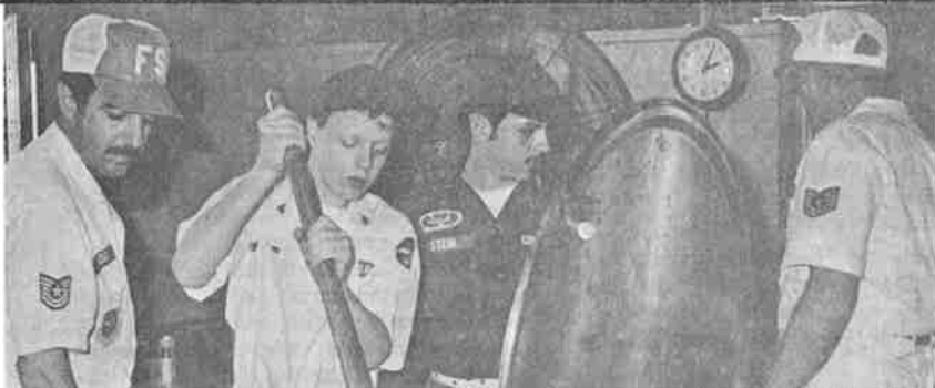
A Civil Air Patrol Cadet assists in preparing a meal during Annual Field Training at Gulfport. The youngster's unit trains with the New York Air National Guard in Schenectady.

You will note, that most of us are not confronted with all 12 rules, on a daily basis. However, it is important that we are familiar with them, so that when various situations arise, we will be able to handle them in a professional manner. By accepting our OPSEC responsibilities, our unit will have a sound OPSEC posture, and thereby ensuring that our mission objectives are effectively accomplished.