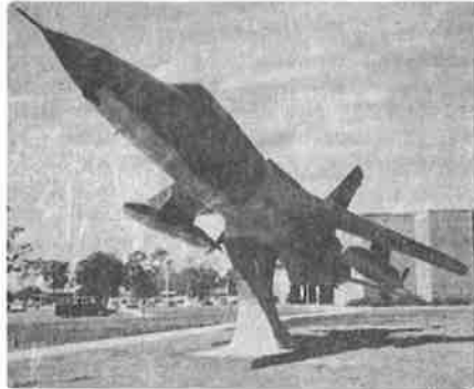
Display at Keesler AFB, Mississippi